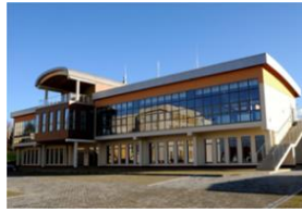
12th ECBA in University of Rzeszow