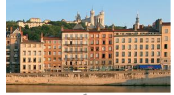
The 6 th ESA in Lyon University