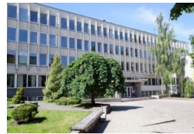
8th AAC in Siauliai University