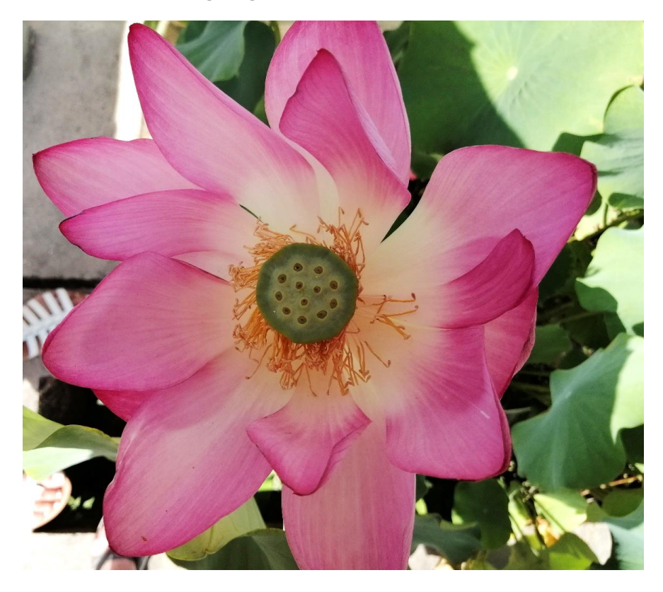
Fig. 4 A lotus flower