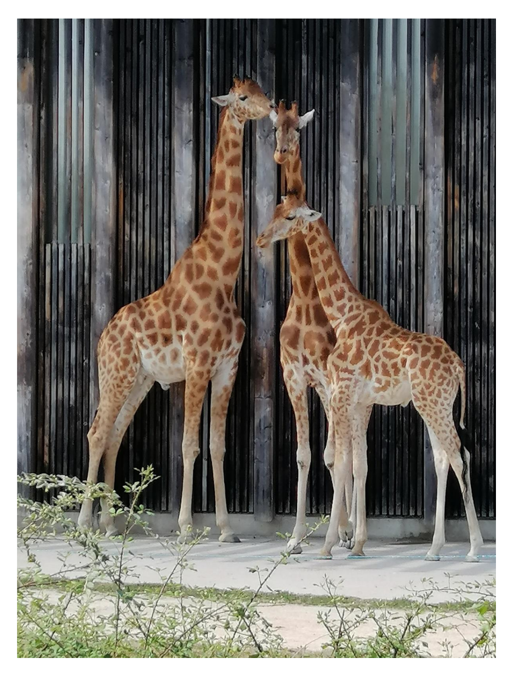
Fig. 5 Close to the botanical garden, there was also a ZOO.

At the end of the course, traditionally, the exam was held. With teachers like these the outcome could not be different – everyone passed with flying colours. It was time to say good by to Lyon. For sure we will remember the course and the knowledge we gained will not go to waste.