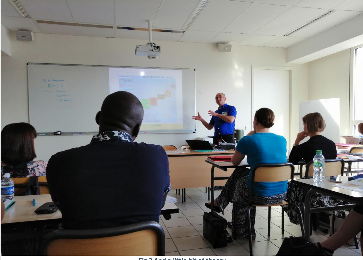
Fig 3 And a little bit of theory