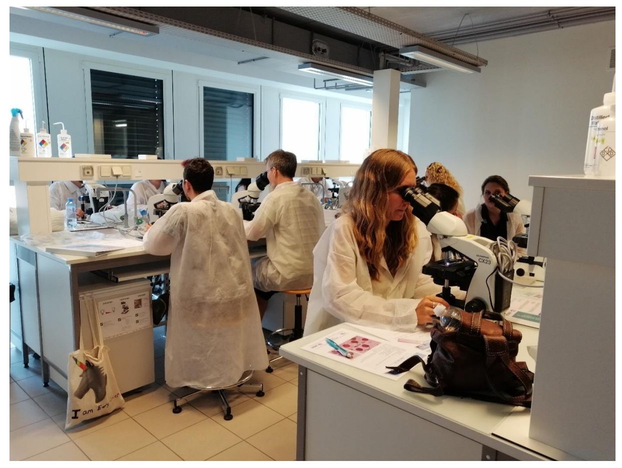
Fig. 2 Practical exercises