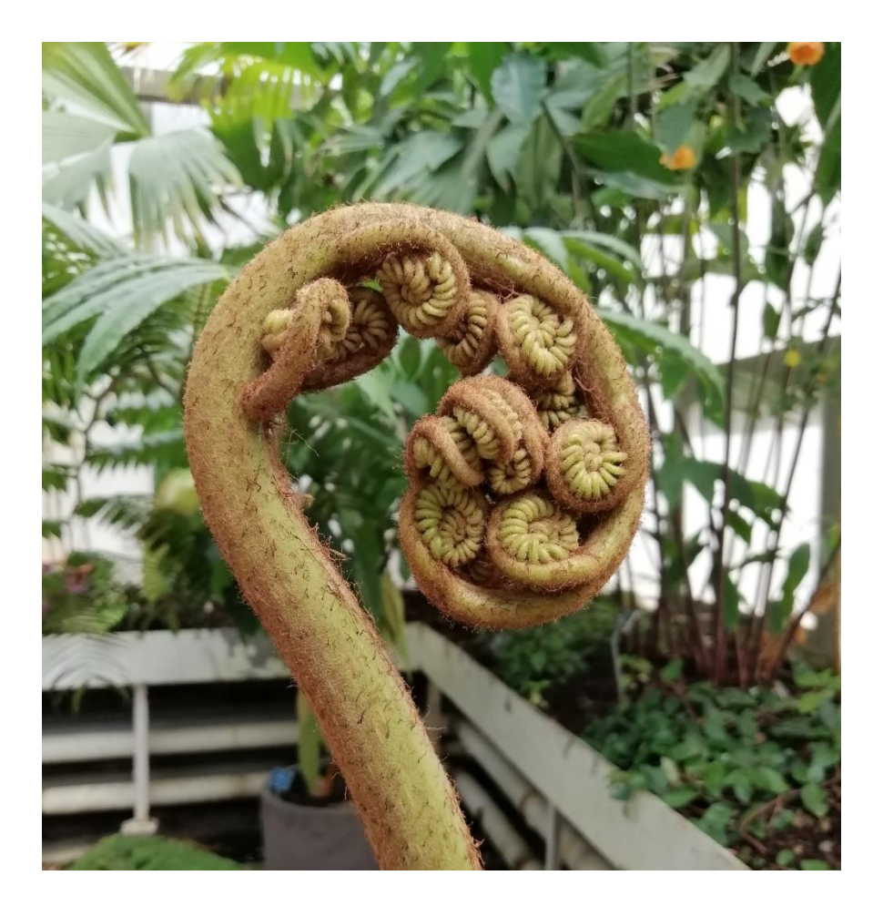
Fig. 3 A giant fern and its leafs