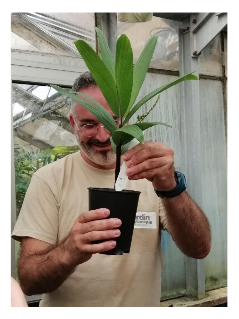
Fig. 2 The most expensive palm tree on the world

To not let our brains turn into the vapour, our schedule had a place for delicious meals and also Lyon sightseeing. On Wednesday we had an opportunity to visit Lyon's old town and botanical garden.